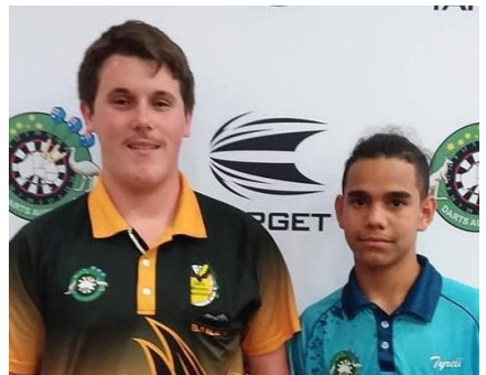
Pacific Youth Masters – Finalist