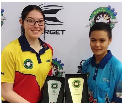
Pacific Youth Masters – Champion